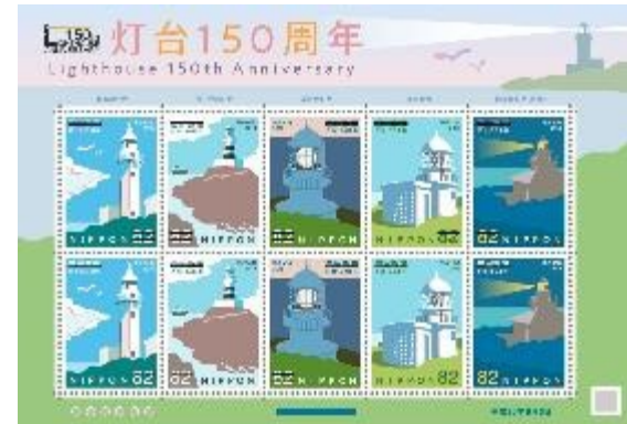
Commemorative Postage Stamps